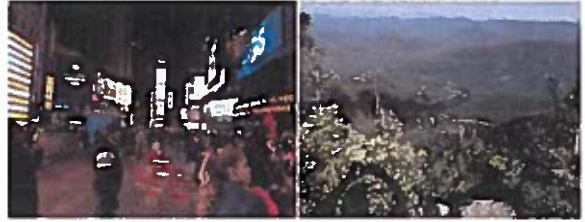
I don't live in New York ,

Rural Schools Association of New York State